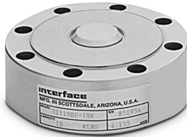
Picture is a representation of model 3211