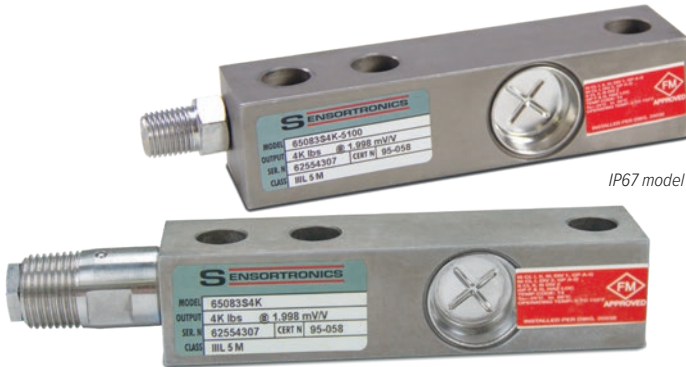
Picture is a representation of actual product