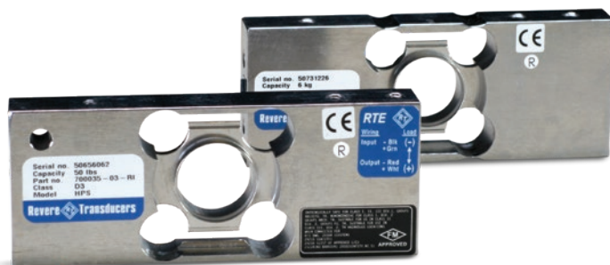
Picture is a representation of actual product